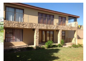
Vermont , Hermanus